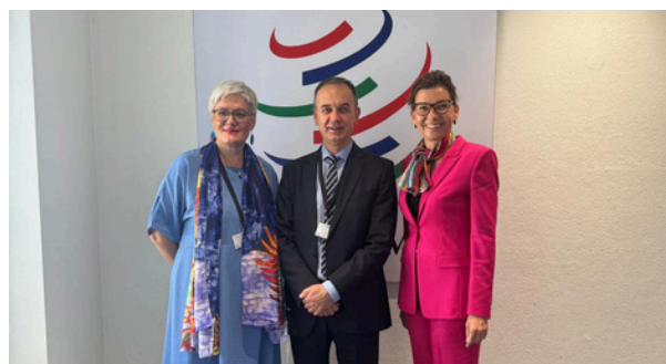
Delegation from Bosnia and Herzegovina at the WTO

Accession to the WTO remains a strategic priority for Bosnia and Herzegovina, contributing to economic stability, legal predictability, and the country's credibility in international markets. The Ministry of Foreign Affairs, in close coordination with relevant institutions, will continue to support the finalization of this important process, with the goal of securing full membership in the near future.