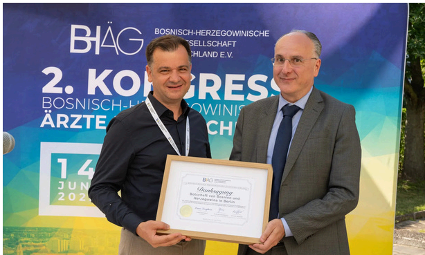
Ambassador Arnaut at the Second Congress of Bosnian-Herzegovinian Doctors