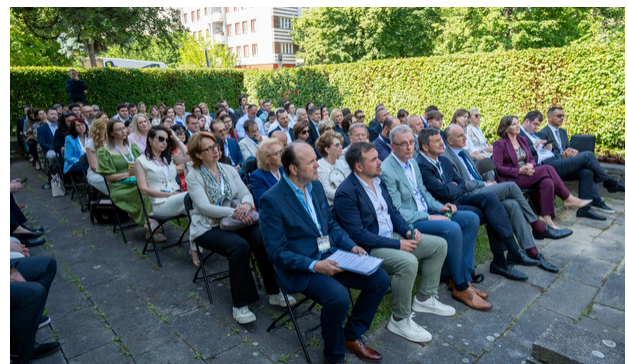
Second Congress of Bosnian-Herzegovinian Doctors in Berlin