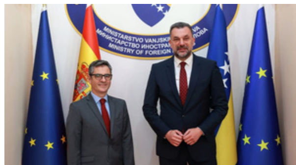
Minister Konaković with Minister Bolanos Garcia

Minister Bolanos Garcia expressed Spain's unwavering support for Bosnia and Herzegovina's sovereignty, territorial integrity, and its European integration efforts, highlighting alignment with EU foreign policy and ongoing reforms. Minister Konaković emphasized that EU membership remains Bosnia and Herzegovina's foremost strategy for securing institutional progress, economic growth, and regional cooperation. Both ministers agreed on the importance of advancing toward the first EU-BiH Intergovernmental Conference to formally launch accession talks.