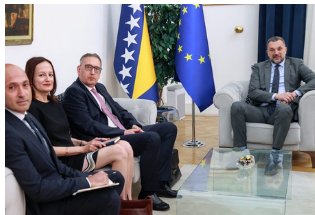
Minister Konaković with CoE Director for Political Affairs and External Relations Miroslav Papa

Srpska and their participation in the Peace Implementation Council's discussions aimed at unblocking Bosnia and Herzegovina's EU path. Director Papa reiterated the Council's close monitoring of the situation and firm commitment to supporting Bosnia and Herzegovina's pro-European actors in advancing human rights, democracy, and institutional resilience.