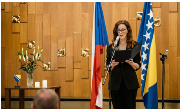
Srebrenica 30th anniversary commemoration held in the Czech Parliament