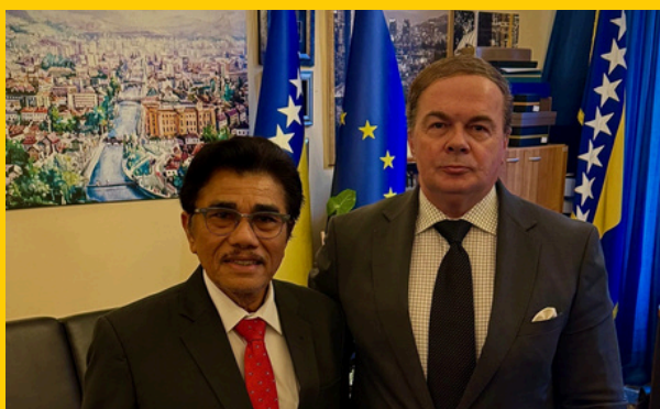
H.E. Manahan Malontinge Pardamean Sitompul, Ambassador of the Republic of Indonesia