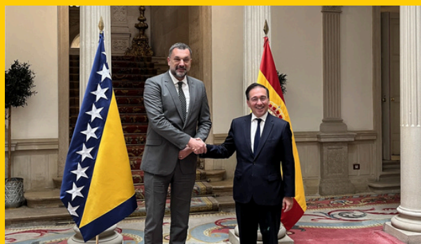
Minister Konaković with Minister Albares