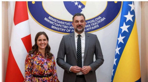
Minister Konaković with Denmark's Minister for European Affairs, Marie Bjerre

advocate of the enlargement of the European Union and said that, despite the current geopolitical challenges, now is the right time to strengthen the European perspective of Bosnia and Herzegovina and the region. As one of the priorities of the Danish presidency of the Council of the EU, she singled out the continuation of political and technical support for reform processes in Bosnia and Herzegovina.