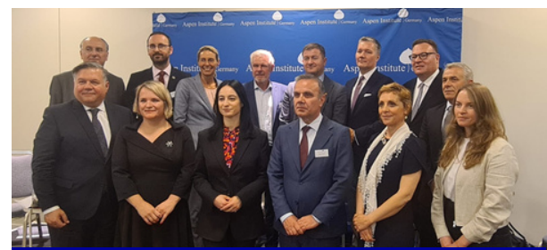
Deputy Minister Brkić at the Western Balkans Working Group in Berlin

Deputy Foreign Minister Josip Brkić participated in the annual meeting of the Aspen Institute Germany's Western Balkans Working Group in Berlin on June 4–5, 2025, which examined the geopolitical landscape and EU enlargement prospects for the region. Speaking on the panel "EU Enlargement and the Western Balkans in a Changing Geopolitical