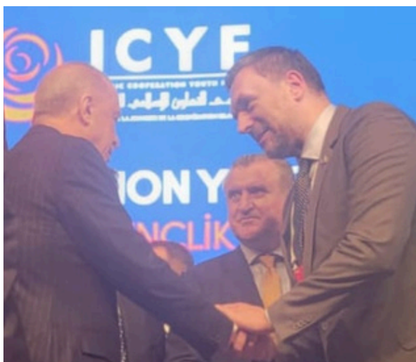
The 20th anniversary of the Islamic Cooperation Youth Forum