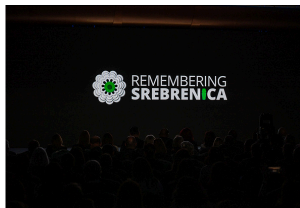
The Women, Peace and Security Forum in Pristina

powerful force for justice, remembrance, and peace. Konaković honored their courage and universal legacy, describing them as a conscience for the world. He pointed out that their legacy is not only for Bosnia and Herzegovina but is universal. He stated that the Mothers of Srebrenica have become a global symbol of pride and justice during one of the darkest periods in Europe's history.