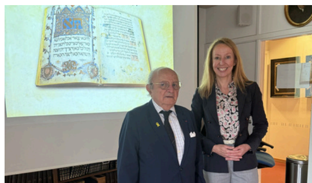
Ambassador Kundurović Miljak and Mr. Jakob Finci

century Sephardic manuscript created in Catalonia, today safeguarded in Sarajevo’s National Museum. Drawing a large audience, the event underscored the manuscript’s profound symbolism of interfaith solidarity and its enduring historical and cultural value.