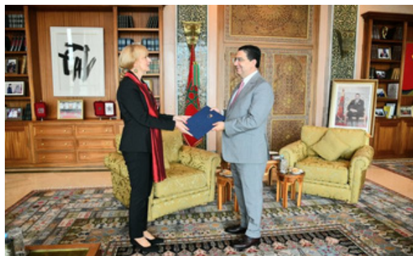
Ambassador Andree Zaimović with Moroccan Foreign Minister Bourita