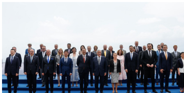
70th Anniversary of Messina Conference