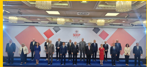
Deputy Minister Brkić at the SEECP meeting in Tirana

Deputy Foreign Minister Josip Brkić represented Bosnia and Herzegovina at the South-East European Cooperation Process (SEECP) Foreign Ministers' meeting held in Tirana on June 16, 2025. Under the theme "Enhancing regional competitiveness and inclusive growth as a pathway to EU integration," Deputy Minister Brkić reaffirmed Bosnia and Herzegovina's strong commitment to regional cooperation and its European future.