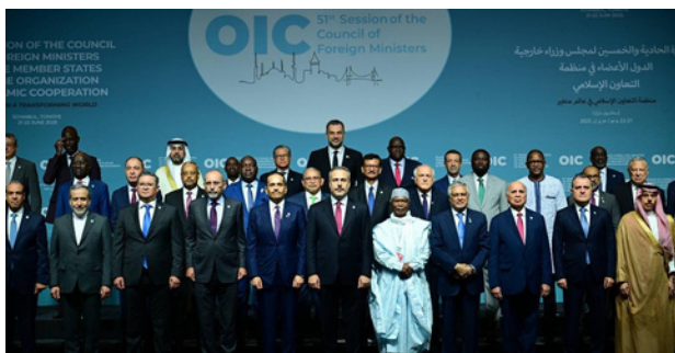
Minister Konaković at OIC Foreign Ministers' Meeting in Istanbul