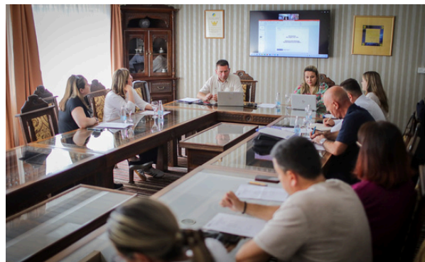
Workshop to strengthen reporting and compliance

and Herzegovina's security policies. The workshop marked an important step in fostering inter-institutional cooperation and upholding Bosnia and Herzegovina's international arms control commitments and security policies. The workshop marked an important step in fostering inter-institutional cooperation and upholding Bosnia and Herzegovina's international arms control commitments.