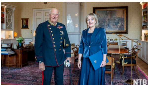
Ambassador Dedić with King Harald V of Norway