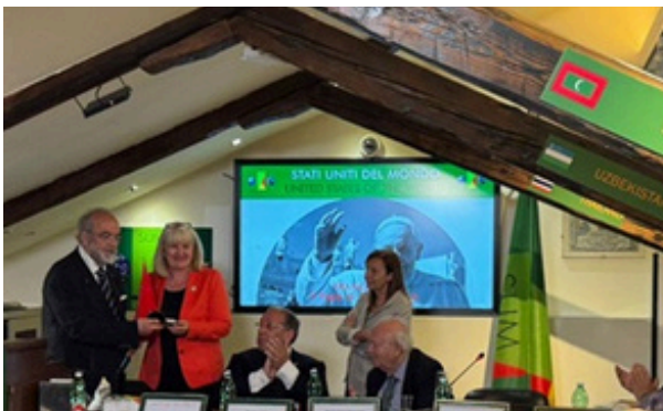
Mediterranean Peace Award Ceremony in Naples